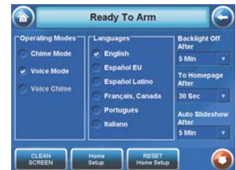
Display and Audio Setup Screen