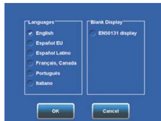
Language Set-up Screen