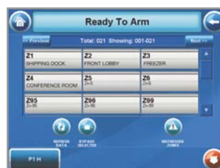
Zone List Screen