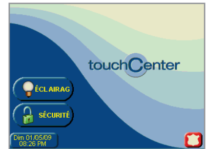
Home screen – French