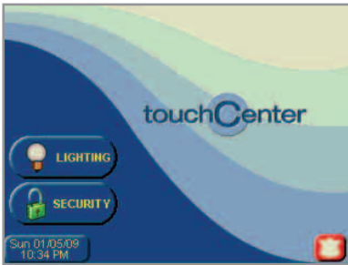
Home screen – English