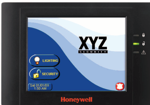
Custom Dealer Screen (6271CB)