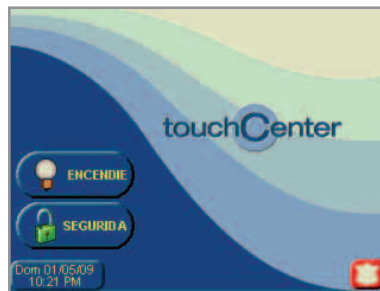
Home screen – Spanish