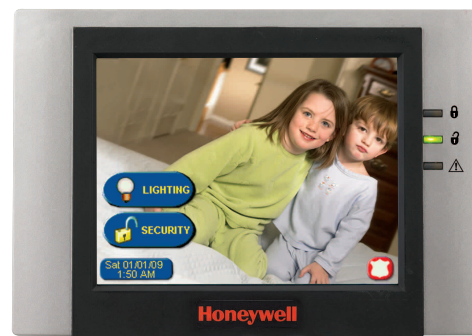
Custom End-User Screen (6271CS)